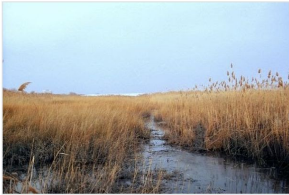
The Meadowlands in New Jersey