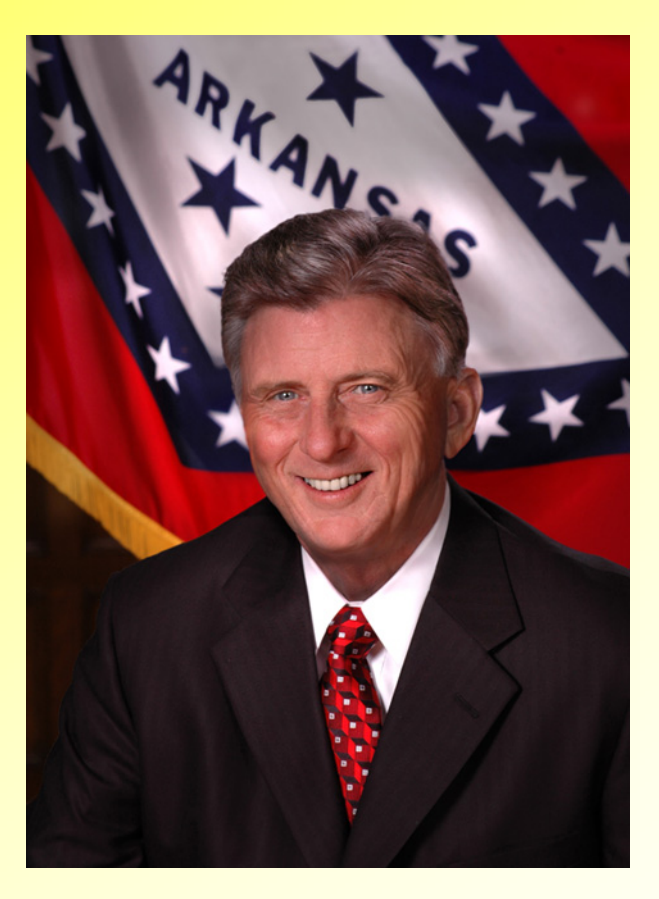
Governor Mike Beebe