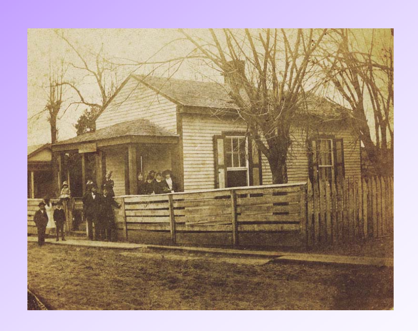
Old Washington Post Office, 1880